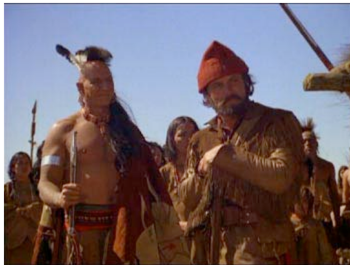
Robert Conrad in the role of Pasquinel, among Pawnee Indians (first episode of Centennial , 1978).

In Jeremiah Johnson , however, the trappers are all English-speaking, including Joseph Robidoux, a trader of French origin. As a comic device, one of Johnson’s companions communicates with the Flathead Chief Two-Tongues Lebeaux in French. This dialogue serves to underscore Johnson’s sense of being linguistically at sea, as he becomes the butt of amusing cultural mistakes. As for The Mountain Men , it gives little space to French speakers and only ever on a deprecatory mode: we encounter a greedy tradesman, Fontenelle, and a lecherous trapper with a foul mouth ( ‘Sacré merde’ , ‘sale con’ , and other such insults) called La Bont.