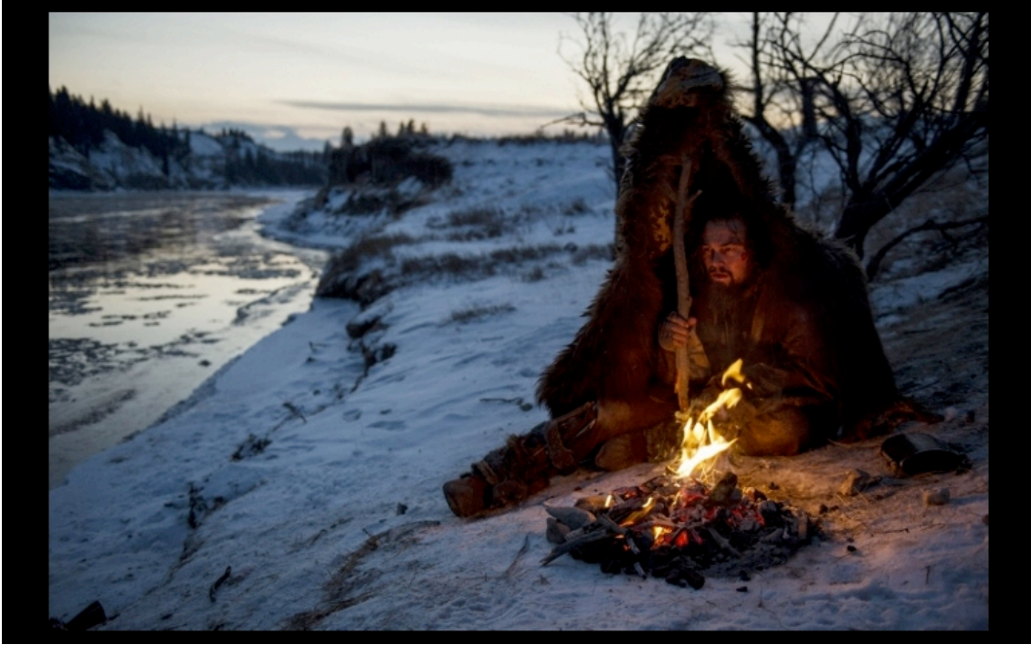
Leonardo DiCaprio (Hugh Glass), on the verge of hypothermia, in The Revenant (2015).

The Revenant offers an excellent reconstruction of everything relating to material culture: costumes, survival equipment, firearms, preparation of pelts, keelboats, small forts, American Indian villages, etc. The production team called on expertise from fur trade historians affiliated with the Museum of the Fur Trade (Nebraska) and the Museum of the Mountain Man (Wyoming). They also worked with linguists specialising in the related Pawnee and Arikara languages spoken by the film's American Indian protagonists. The use of native languages has become a requirement in Hollywood ever since Dances with Wolves in 1990 (despite the fact that specialists find the Pawnee language used in Kevin Costner's film laughable). The last remaining native speakers of Pawnee and Arikara disappeared at the turn of the 2000s, so The Revenant's producers consulted several linguists, including Douglas R. Parks, 10 an anthropologist at Indiana University who has been studying these two languages for almost fifty years. As the film shows, the Arikaras and Pawnees were far from the most 'typical' Indians of the Plains; unlike the Sioux, for example, they were sedentary, agricultural peoples who lived in large earth lodges. For once in Hollywood, here the Pawnees are not restricted to their role as the villains of the Plains. Ultimately, though, we learn very little about the American Indians, who flit across the screen like shadows.