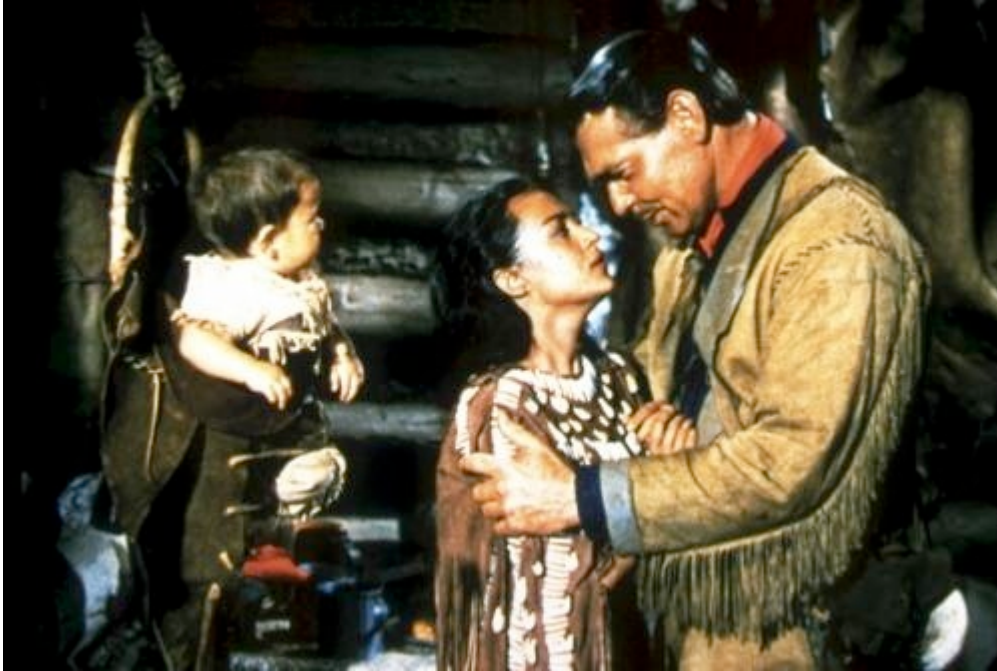
Clark Gable (Flint Mitchell), María Elena Marqués (Kamiah) and their mixed-race child in Across the Wide Missouri (1951).

If the world of trappers has such a small foothold in Hollywood imaginations, this is firstly because it reveals a less edifying side to the Frontier, a more ill-defined, mixed space with a more uncertain future. Unlike the farmer or the cowboy, the mountain man seems to be a default pioneer, a useless and unreasonable adventurer travelling the length and breadth of the wilderness without settling down, putting up fences, or working the land. Compared to the traditional Western hero, his allegiances are less clear-cut, his identity more unstable, to the extent that he might even disappear into Indian country, sometimes in order to find a new lease of life. The history of trappers therefore maps imperfectly onto the pre-constructed (teleological) narrative about the conquest of the West. 4 To take up the expression neatly coined by Claude Lévi-Strauss, reader of Heart of Darkness , these men belong to the ‘Conradian’ period in American history: ‘the depth of which varies from several decades to several centuries, during which indigenous cultures and those of the invaders or colonisers co-existed, creating sometimes friendly, sometimes hostile relationships, and when the fate of the former was not yet definitively sealed’. 5