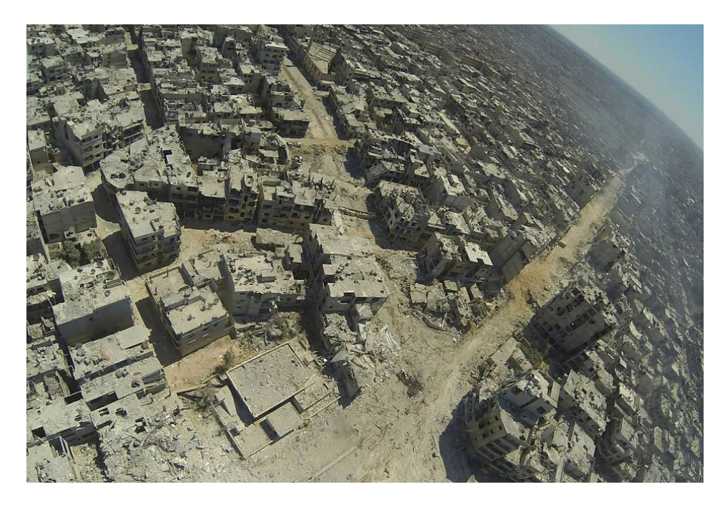
Photo 1: Impacts of bombings on the district of Khaldiyye in Homs in July 2013 (credits: AFP/Getty images) Source: The Mail on Line (http://www.dailymail.co.uk/news/article-2380913/Syria-Homs-aerial-pictures-scale-destruction.html), 29 July 2013.

maintaining a certain porosity between zones. This is however becoming increasingly limited as the conflict deepens.