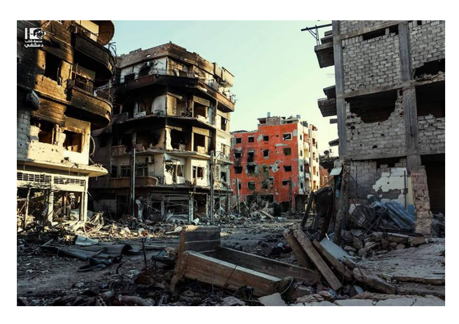
Photo 2: Destructions in Darayya, a southern suburb of Damascus, on 19 January 2016

In areas under governmental control, destruction is non-existent, such as for example in the coastal town of Tartus, which is far removed from the combat zones; or it is limited, as is the case in the central districts of Damascus. In such cases, it results from rocket and mortar fire from armed opposition groups, or from bombs<sup>19</sup>. It therefore affects the urban fabric in a scattered and punctual manner. It is the districts on the edges of these zones that are the most affected.